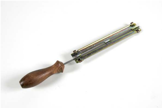
Chain Saw file & guide 3/16"