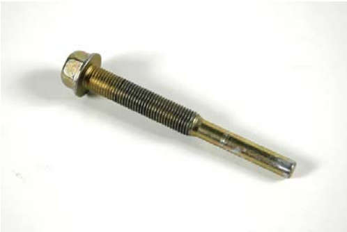
Chipper impeller service tool

Used to pull the impeller off of the crankshaft