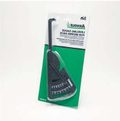
Deck leveling gauge

Used to measure blade tip height while leveling the deck.