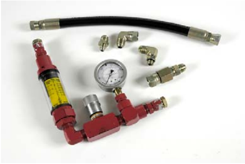
Hydraulic test kit

Used to diagnosis log splitters and tractor hydraulics.