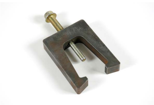
Self propelled chipper/shredder vac impeller service tool

Used to pull the impeller and engine pulley off of the crankshaft. The jack screw of this tool will remove all chipper shredder impellers