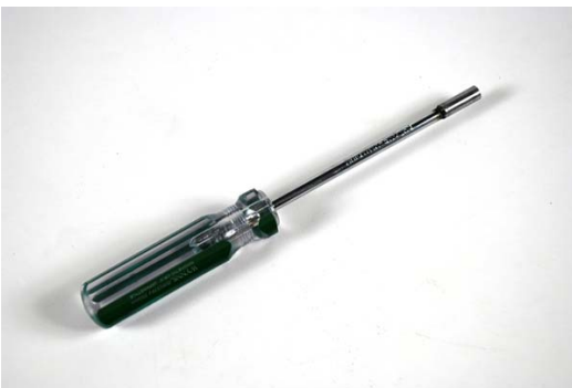
Zama carburetor adjustment tool - offset pin

Used on the Zama carburetors that have the offsite pin adjustment screws.