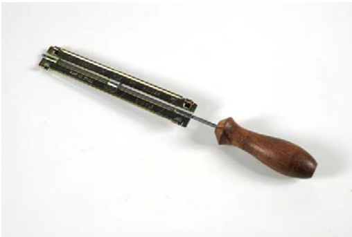
Chain Saw file & guide 5/32"