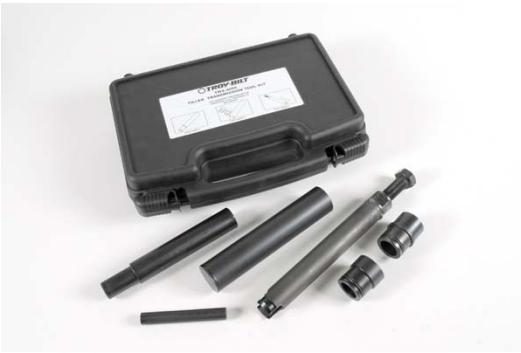
Troy-Bilt tiller seal service tool set

Used to remove and install the oil seals on all Troy-Bilt tillers. *contact Thexton Toolworx ph. 800-328-6277