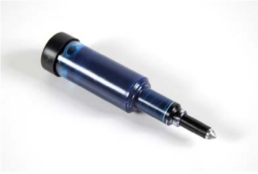
Chain saw needle grease tool