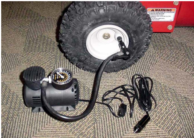
FIGURE 5 - Portable Electric Tire Inflator

6. Verify tire pressure as instructed in the Checking Air Pressure section.