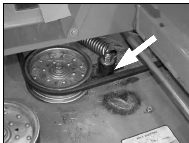
2. Belt Installed Correctly Rub point (arrow) if something else is wrong