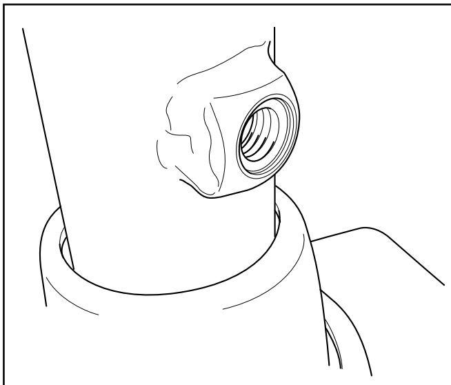
Diagram no. 1

If a thread is damaged it is recommended that an M8 Helicoil is fitted.