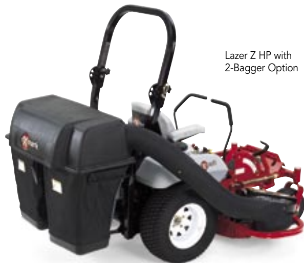
Lazer Z HP with 2-Bagger Option