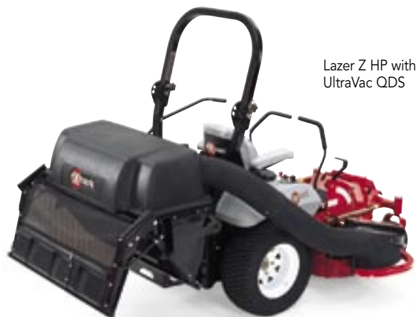
Lazer Z HP with UltraVac QDS