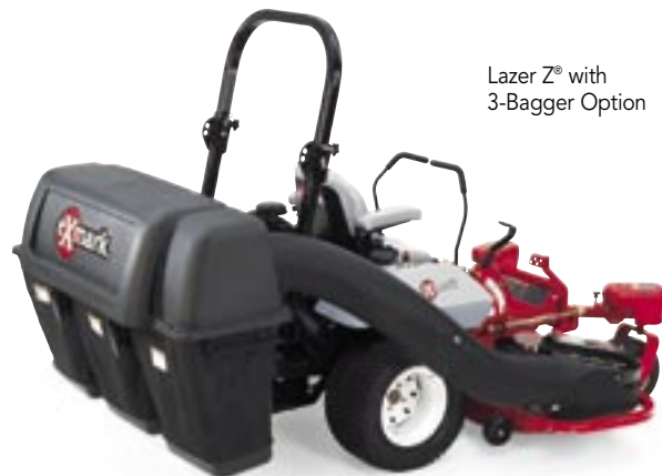
Lazer Z® with 3-Bagger Option

With this innovative collection system, grass discharge is quickly accomplished in one simple motion of the release lever.